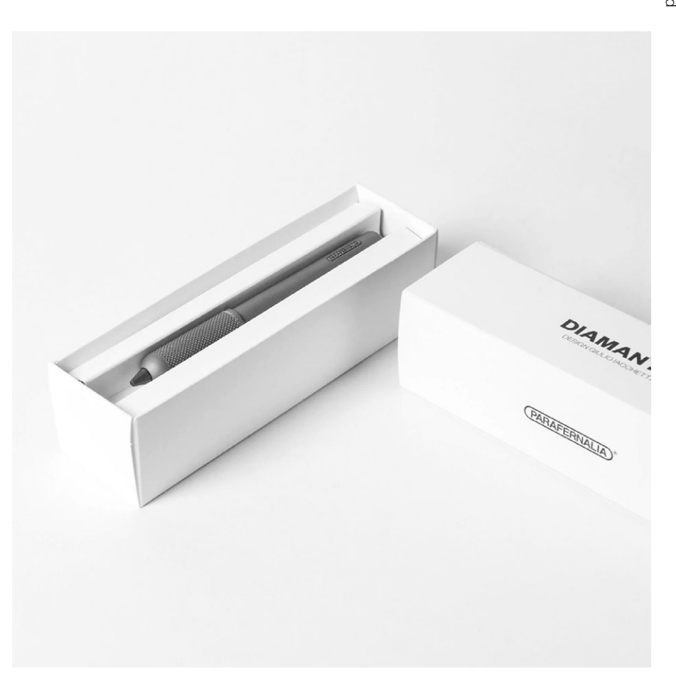
Dimensions (mm) 145x40x40 | Materials Cardboard | Customization Digital UV printing