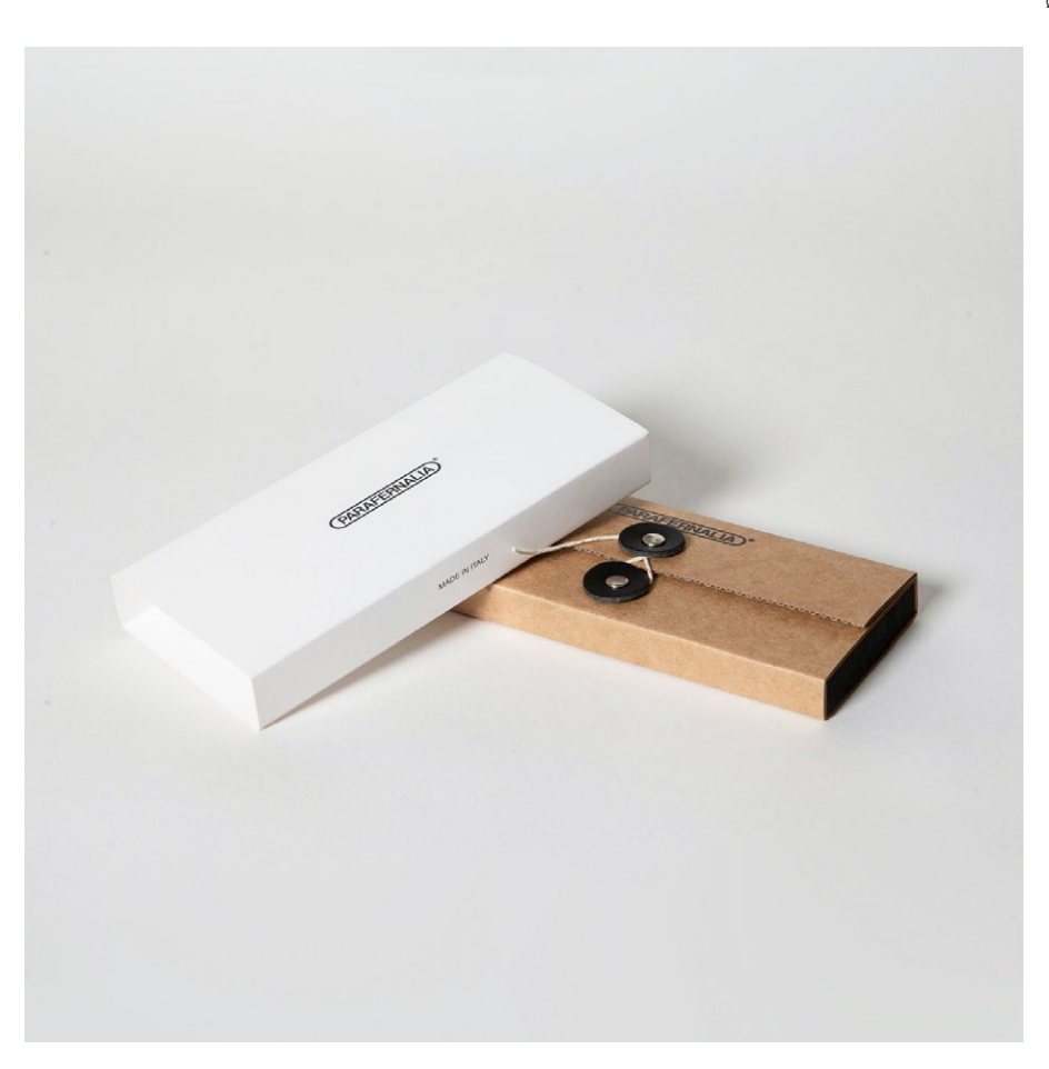
Dimensions (mm) 150x70x20 | Materials Cardboard - FOAM | Customization Kraft Box and Sleeve (white cardboard) with digital UV printing.