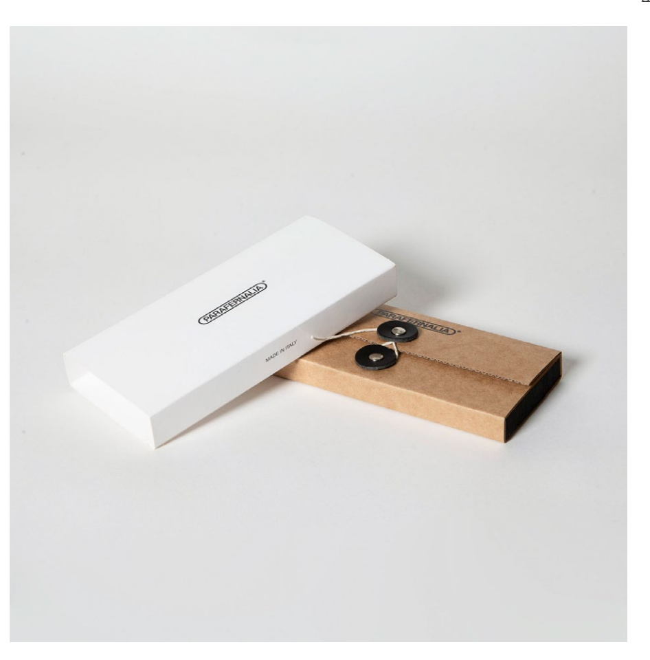
Dimensions (mm) 150x70x20 | Materials Cardboard - FOAM | Customization Kraft Box and Sleeve (white cardboard) with digital UV printing.