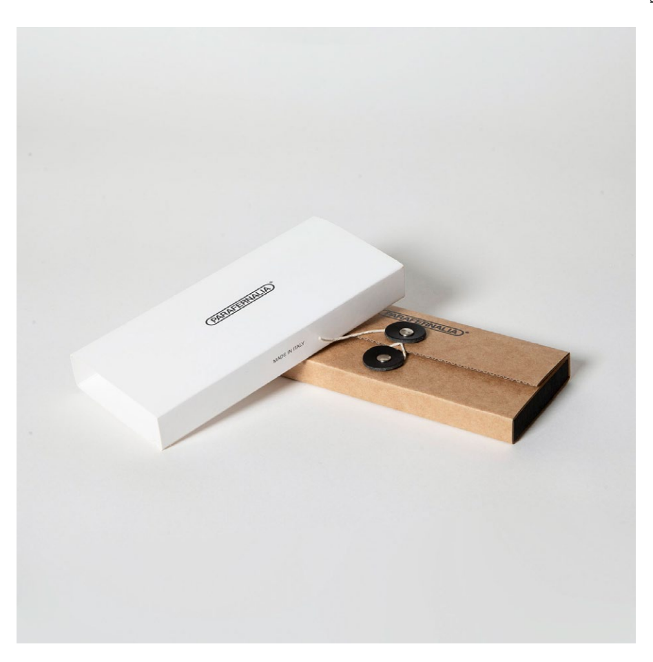
Dimensions (mm) 150x70x20 | Materials Cardboard - FOAM | Customization Kraft Box and Sleeve (white cardboard) with digital UV printing.