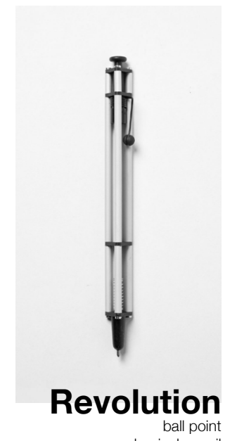
Revolution ball point mechanical pencil + DESK STAND *declinable for each pen